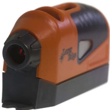
Figure 1 Single-beam laser level with dual spirit levels.

We have found these devices to be excellent tools for marking patients prior to surgery. Examples include alignment for nipple positioning prior to nipple reconstruction, positioning of a neo-umbilicus during abdominoplasty or autologous breast reconstruction using abdominal tissue and for marking the midline and other points prior to breast reduction. Numerous other applications also exist, especially in a research setting to obtain accurate data regarding aspects of symmetry or alignment in many areas of the body. Figures 3 and 4 are examples of the laser line in use.