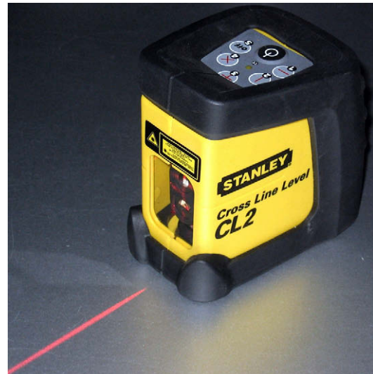
Figure 2 Cross-hair laser level.