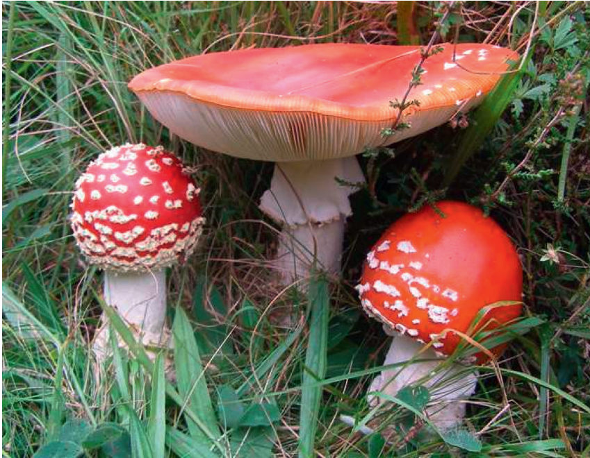
FIGURE 6 Amanita muscaria