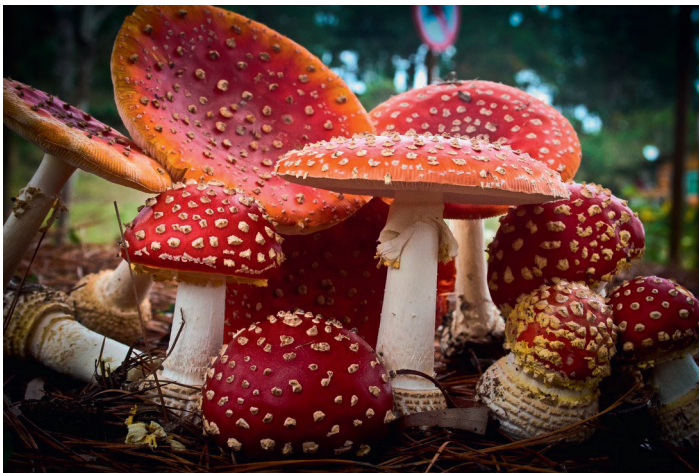
FIGURE 1 Amanita muscaria (fly agaric) [Russian: Myxomop ( Mukhomor )]

The importance of culture-specific dimensions in studying the use of psychoactive substances has been highlighted by a number of recent studies dedicated to the subject. 1 Of particular interest are the issues of body politics and