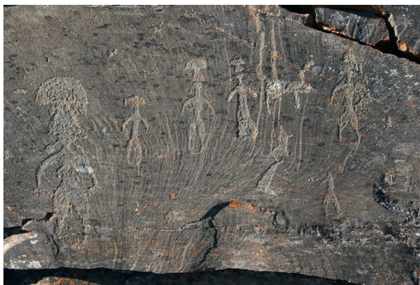
FIGURE 4 Chelovek-Mukhomor (Human- Amanita muscaria ) at Chukotka archaeological site