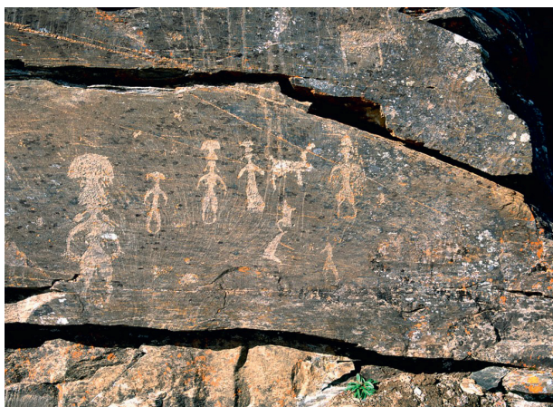
FIGURE 5 Another photograph of the same petroglyph site in Chukotka, which displays the examples of human-mushroom syncretism