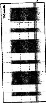
Figure 4. Switched 40 Gb/s optical packets.

As a proof of principle, we demonstrate the use of the DFB flip-flop within an actual all-optical packet switching configuration. Based on the routing information (contained in the header of a data packet), a header processor switches the all-optical flip-flop on by sending an optical pulse. The optical flip-flop stores the temporal decision of the header processor while the payload is being transferred to the right output port. An illustration of the realization of all-optical packet switching using a DFB laser as all-optical flip-flop is demonstrated in Fig. 4 where the switched 40 Gb/s data packets are shown.