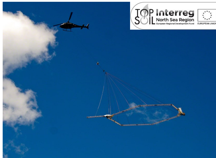
Figure 2. SkyTEM system