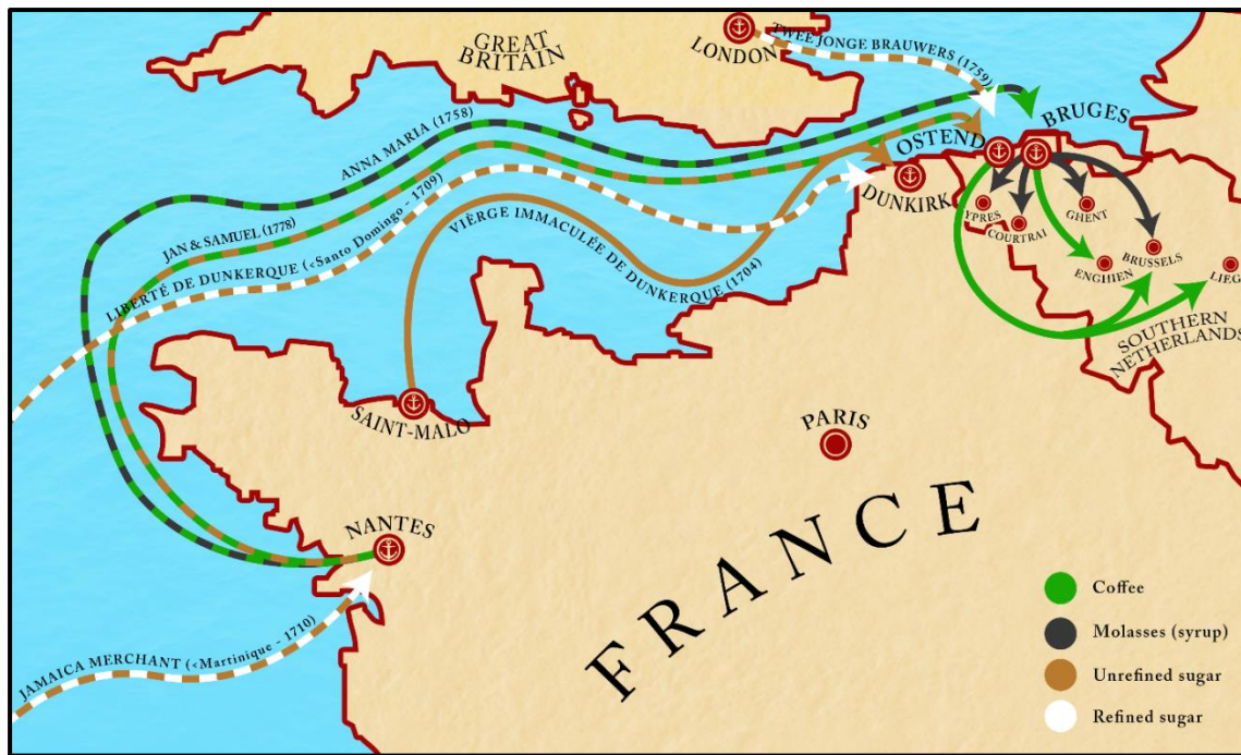
Figure 4. Intra-European flows of sugar & coffee as mentioned in the Prize Papers, 1702-78