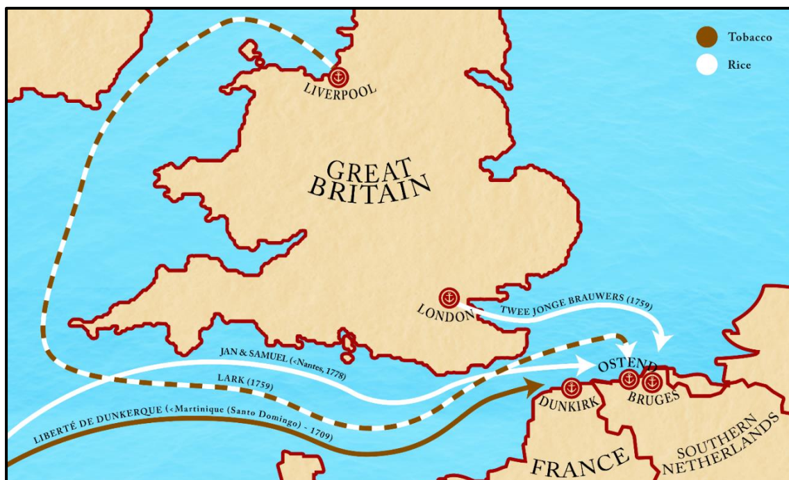
Figure 3. Intra-European commodity flows of rice & tobacco as mentioned in the Prize Papers, 1702-78