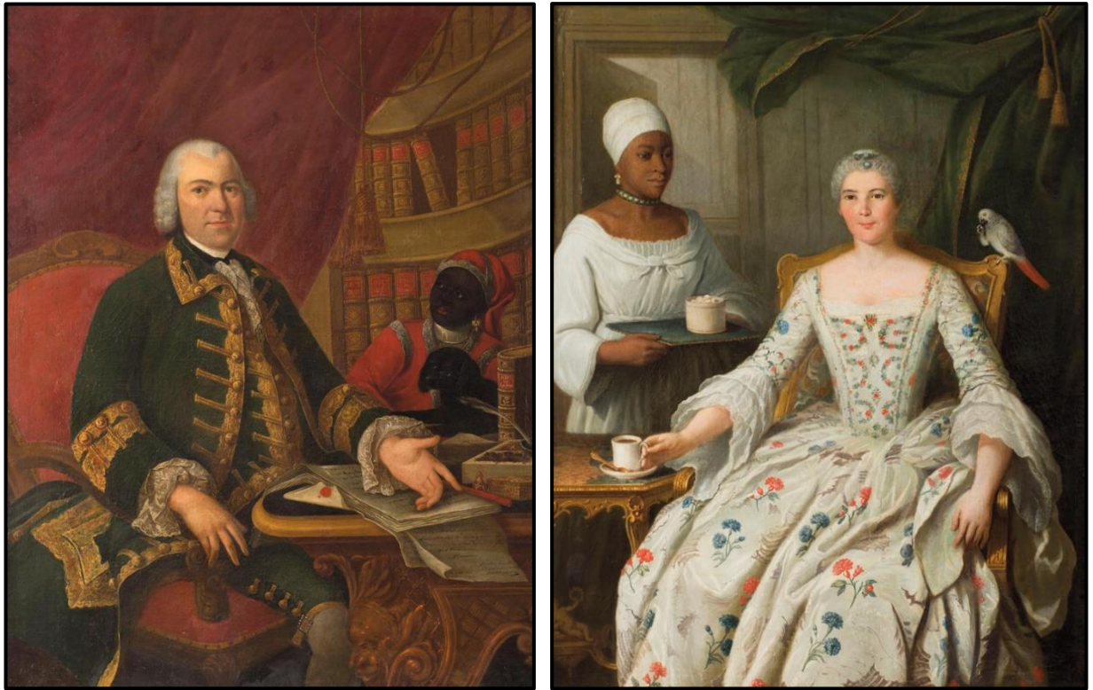
Figure 5 & 6. Portraits of Dominique and Marguerite-Urbane Deurbroucq by Pierre-Bernard Morlot, 1753

Source: Ministère de la Culture et de la Communication au bénéfice de la ville de Nantes.