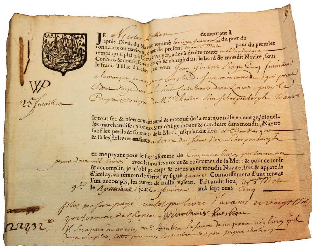
Figure 1. A bill of lading found on Vierge Immaculée de Dunkerque , captured 1704 by the British

commercial activity in Ostend during and immediately after the period of the Seven Years' War due to a decree declaring Ostend as an 'entrepôt'. This allowed merchants to store merchandise for the duration of one year and plan their commercial imports differently, presumably speculating on a wider range of commodities. 9 Another upsurge was caused by the 'free port' status which Ostend gained in 1781. All ships navigating under imperial colours were henceforth to be considered neutral, and were effectively recognised as such by the belligerent nations involved in the American Revolutionary War (1775-1783) and the Fourth Anglo-Dutch War (1780-1784). Consequently, merchants of all nations flocked to the city, even forcing the government to build more houses. 10