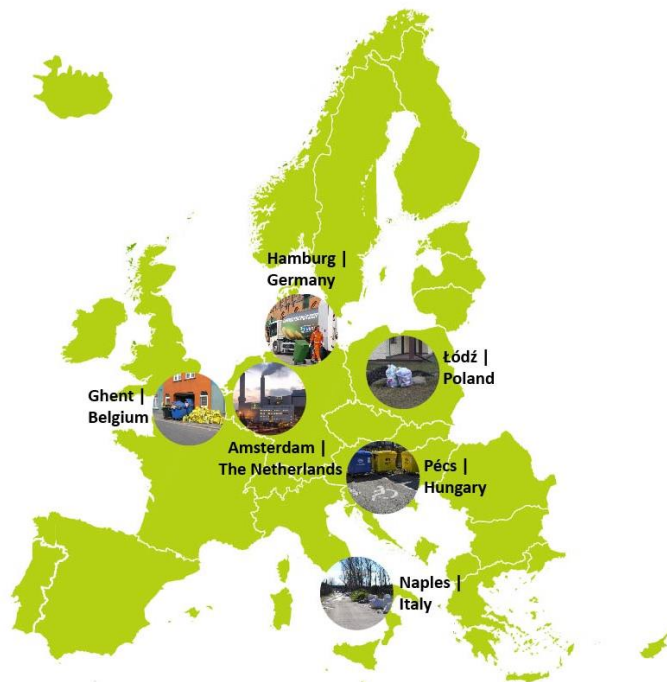
Figure 1. The six case study areas of REPAiR; Amsterdam and Napels (pilot cases) and Ghent, Hamburg, Łódź and Pécs (follow-up cases).

These objectives may boost the development of eco-innovative solutions to prevent waste generation and promote the use of waste as a resource. The aim is to enhance the natural and living environment in urban and peri-urban areas and assure that developing and demonstrating eco-innovative solutions in real-life environments will enhance their market uptake and contribute to sustainable urbanisation worldwide. REPAiR uses two pilot studies in Naples and Amsterdam (case study areas) to develop the GDSE. The rationale behind this being that the Naples case focuses on territorial and landscape questions, whereas the Amsterdam case focuses on waste/resource flow optimisation and business development. The follow-up studies (Ghent in Belgium, Hamburg in Germany, Łódź in Poland and Pécs in Hungary) include both challenges (Figure 1). The wide array of characteristics within this set of cases makes them representative for many other European metropolitan regions.