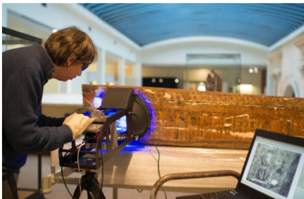
Figure 1. Example of a scanning session with a multispectral PLD at the Royal Museum for Arts and History

RTI/PTM and PLD have been developed by different research labs, resulting in 2 similar but different approaches and incompatible output files, which have to be viewed with separate, proprietary software. Pixel+ will merge both technologies by developing a Windows/Mac OS X/Linux viewer and a web viewer which will be capable of displaying all file formats with their respective shaders and metadata and have the ability to illuminate the virtual model. The OS based viewer is targeted to the professional user (researcher, curator, scientist) which already has work experience with PLDViewer (fig. 3) and RTIViewer (fig. 4) and will include more CPU heavy algorithms like calculating depth profiles. The web viewer will focus on a more general audience and will facilitate sharing these file types and allow content providers like museums to open up their interactive pixel based collections to the public, as a modern browser is the only software that the end user needs to view these virtual artifacts.