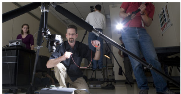
Figure 2. Example of an RTI scanning session