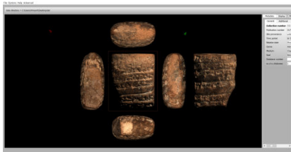
Figure 3. A PLD file of a cuneiform tablet, opened in PLDViewer