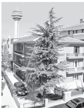
Figure 8. Pine Tree and a House (Günay, 2006)