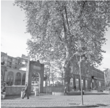
Figure 5. Trabzon Square: The Mosque and Plane Tree (Gedikli, 2012)