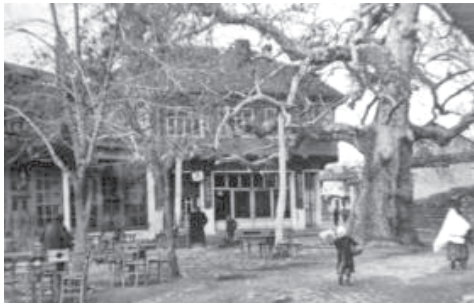
Figure 10. Çınaraltı Square in 1946

The history of the site and tree is not clear in the current sources. However, an interview conducted with the mayor of Yalvaç city, Mr. Tekin Bayram, has revealed some clues regarding the historical background of the square. The mayor states that, history of the plane tree dates back to the Battle of Myriokephalon in 1176. During this war, army of the Crusades had been defeated near Yalvaç region and Turkish empery had proven its dominancy in the Anatolian region once again under the leadership of Kılıçarslan the Second. It is believed that Kılıçarslan's brother and Emir Ahmet came near to the Yalvaç city, and Yalvaç plane tree had been planted as a sign of victory at the beginning of the 13th century A.D. The Devlethan Mosque near the plane tree was built in the 14th century in the name of the brother of Kılıçarslan the Second. According to the mayor, the Seljuk Bath, mosque and plane tree all in close vicinity give clues regarding the settlement pattern in Seljuk period.