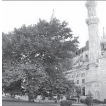
Figure 6. Edirne: Selimiye Mosque and Plane Tree (Günay, 2007)

The symbolic value of the mulberry tree is also remarkable. It is known as the home tree and planted in front of the houses before they are built. The mulberry tree is planted to prevent bad luck, to bring happiness and luck to the home, to mark their territory and to provide shade as well. It stands for that the spirit of houses, and provides happiness and profusion (Ergun 2004, 238).