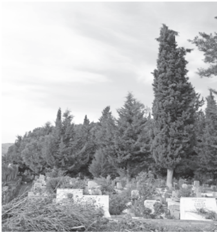
Figure 3. Cemetery and Cypress Trees (Personal Archieve, 2012)