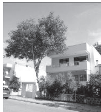
Figure 9. Walnut Tree and a House

The figures 7-8-9 illustrate the house and tree relationship in Turkey. They are from various settlements from Turkey, and in each one of it, there is a different housing and tree type which makes this tradition (or ritual) significant for the urban fabric. In spite of being a spontaneous application, this sort of tree use indicates a valuable urban feature that has a word in the