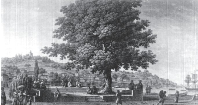
Figure 2. Small Raised Square with a Plane Tree