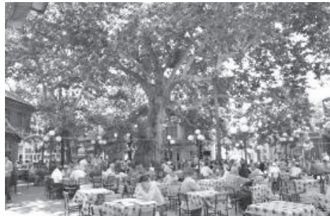
Figure 11. Çınaraltı Square in 2012