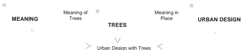
Figure 1. Connecting the Concepts: Meaning, Design and Trees

Trees, as the first source of food, shelter and worship for man, are one of the most valuable living things on earth. From early times till today, people have always been in contact with trees, but once worshiped as gods or holy spirits, they now enrich urban exterior spaces. That is, this long-standing relationship is concealed behind the appreciation of existence of trees, and in turn the extensive use of them in the built environment. However, a child who plays around a tree, a person who planted a tree to honor the birth of his child or to provide profusion for his home are the meaningful remnants of this deeply-rooted relationship. Whether tangible or not, these facts point out a strong connection between people, trees and spaces that needs a comprehensive study covering a range of meanings of trees from physical to symbolic that may influence a person who walks by trees on streets of his/her city.