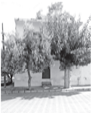
Figure 7. Mulberry Tree and a House

The common tradition of planting trees in front of houses can be interpreted in terms of two aspects, the first of which is the visible impact of trees on the urban layout and the second aspect is the maintenance of a deeply-rooted relationship. In terms of the first aspect, trees planted in front of houses can be perceived as an integration of green to the urban tissue. Le Corbusier, for instance, states that “A Turk, before he builds a house, makes the garden and plant the tree, while French cut the tree to build the house.” (cited in Ergun 2004, 299) although the present situation has turned the other way around. For the second aspect, there seems to be a symbolic value of these trees for the owner of houses even if it stays hidden nowadays.