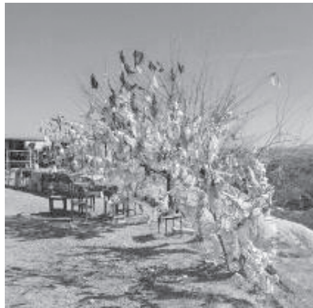
Figure 4. A Wish Tree in Cappadocia (Oktay, 2012)

Another example is the trees which are planted next to tombs, mausoleums and mosques. It is almost impossible to think of a tomb or mosque without a tree in its close vicinity. The reason can be the meaningful remnants from the earlier rituals of associating trees with divinity and gods. Today, the trees planted near worship related places or tombs are believed to symbolize the existence of god and protect the spirits of dead ones (Figures 5-6).