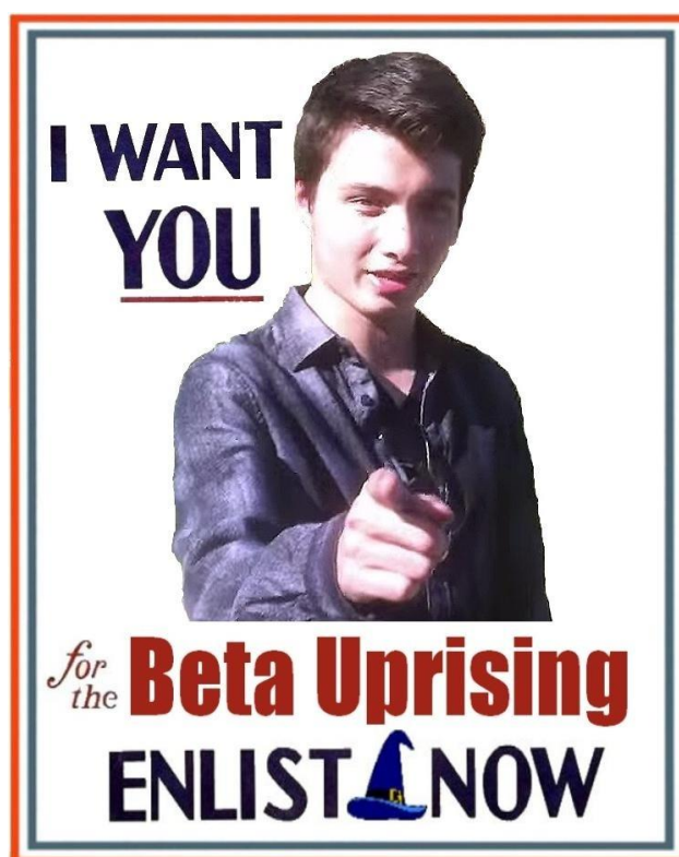
Figure 4: Elliot Rodger the beta male meme.

If we now return to Rodger's manifesto using Nagle's description of alpha and beta males, it is overly clear that Rodger self-identified as a beta male, a victim of a society in which women – way too independent and manipulating as they were, in his view – consistently ignored him in favor of more brutal, muscular and rugged types of (alpha) men. The latter, whom Rodger saw as stupid and naïve because they walked into the traps set out for them by women, also became his enemies, and eventually his victims during his Day of retribution. This act of uncompromising beta-masculine ideological rectitude turned Rodger into some kind of icon of the beta male camp, as we can see in Figure 4: