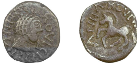
Æ quinarius – 1.6 g – 13.45 mm (picture 2 × actual size)

I N 2016 A SILVER ANNAROVECI quinarius (Scheers [1977] 58; LT 8893; DT 638) [1] was offered by a metal detectorist for identification. The coin originates from on a field in Halle-Booienhove (Zoutleeuw). Other related finds consisted of fragments of Roman ceramics, bricks and tiles.