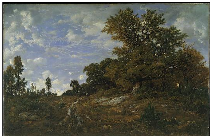
Image 2: Théodore Rousseau. 1852-1854. The Edge of the Woods at Monts-Girard, Fontainebleau Forest.