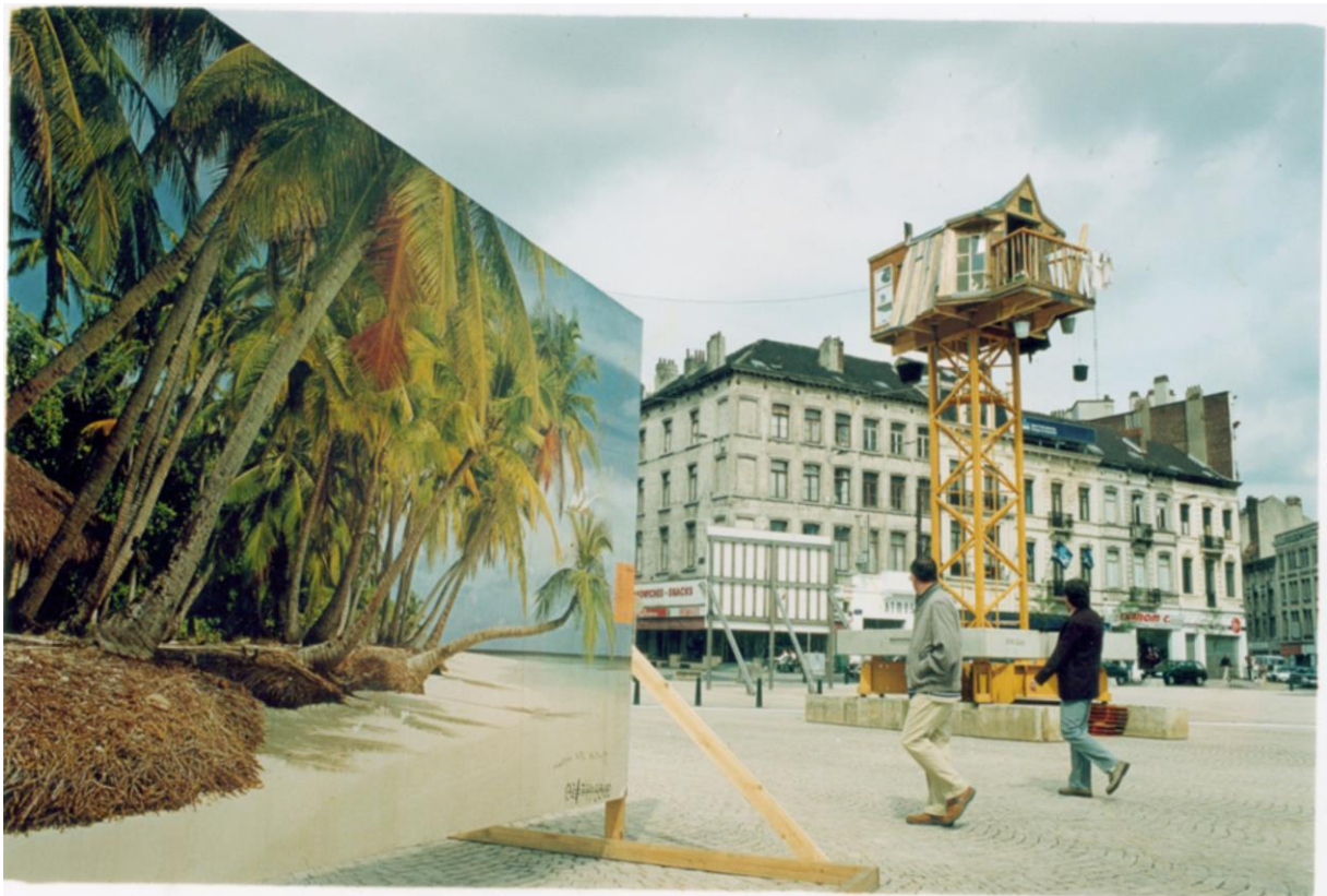
Image 4: Bara/ke (2000).

IF YOU PICK UP THINGS, THEY CHANGE THEY'RE PICKED UP THINGS NOW AND THAT IS SOMETHING TOTALLY DIFFERENT (Verdonck 2008, 436)