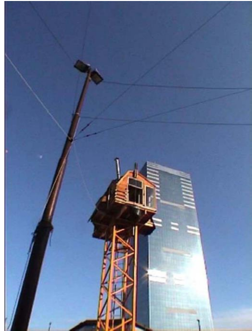
Image 3: Bara/ke (2000). © Benjamin Verdonck. All rights reserved.

i like collecting things things people leave in the streets or things they lose gloves for instance (I'm imagining a big room with all my picked up gloves nicely assorted on the wall, people who've lost their glove can ask [for] it back at the counter – where they're kindly served coffee and cake – if they offer me a second glove)