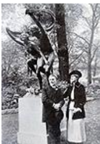
Fig. 3. Malvina Hoffman, Russian Dancers, 1910-1919. Bronze. Paris, Luxembourg Gardens.