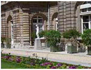
Fig. 9. Hélène Bertaux, Psyche sous l'empire du mystère , 1889. Marble. Paris, Luxembourg Gardens.