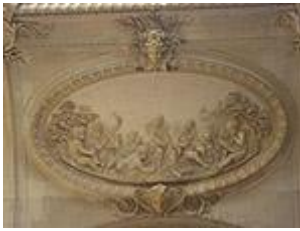
Fig. 19. Noémie Constant-Cadiot (pseud. Claude Vignon), Allegory of the arts (Les Génies des Arts entourés de leurs attributs) , 1857. Stone. Paris, Palais du Louvre, Escalier Lefuel.