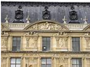
Fig. 17. Hélène Bertaux, Legislation and two pendants: Moses and Charlemagne , 1878. Stone. Paris, Palais des Tuileries, Rivoli wing, Pavillon Marsan, court side.