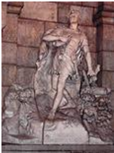
Fig. 6. (Marie-Adrienne-) Anne de Rochechouart-Mortemart, Duchess of Uzès (pseud. Manuela), Saint-Hubert with hounds , 1889. Stone. Paris, Montmartre, crypt of the Sacré-Coeur Basilica.