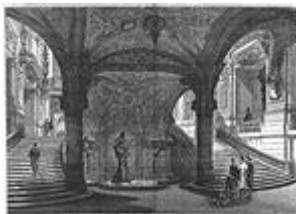
Fig. 40. Marcello's Pythia under the grand staircase, looked at by contemporaries visiting the Opéra Garnier.

that has made it into the canon, is revealed, in between the two marble staircases leading the elite visitors into the grand entrance hall (fig. 40).