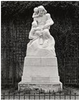
Fig. 4. Yvonne Serruys, Faun with children , 1911. Marble. Paris, Place Louis Blanc.

melted down in 1942 (fig. 3). 16 Also in 1911, the city of Paris bought Yvonne Serruys's (1873–1953) monumental marble Faun with Children and placed it (in 1930) on the Place Louis Blanc. While that may sound prestigious, the Place Louis Blanc is a forgotten little square near the Gare de l'Est, where Serruys's sculpture is placed on a pedestal but with its back to a wall (fig. 4).