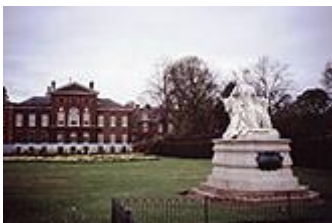
Fig. 23. Prinses Louise Caroline Alberta, Duchess of Argyll, Queen Victoria as a young monarch , 1887–1893. Marble. London, Kensington Gardens,