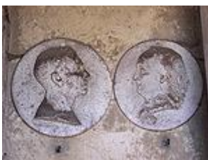
Fig. 7. Marguerite-Fanny Dubois-d'Avesnes, Medallions of Eugène Scribe and his wife Marie-Julie-Clarisse Marduel , 1867. Plaster. Paris, Père-Lachaise Cemetery (35th division).

Even when they were sculpted in the round, many sculptures by women were attached to, or placed against walls, at times in “sheltering” niches. Marie-Louise Lefèvre-Deumier’s stone semi-nude nymph Glycera (1856-61) for example, is found in a ground-floor niche of the Louvre’s Cour Carrée (fig. 5). 19 Sometimes women’s sculptures are positioned right next to buildings, figuratively and often literally in their shade. In other instances, they are placed so high up on buildings or monuments that they can only be seen from afar, or unclearly, or both. In this category are all sculptures made by women, other than Glycera , for the outside decoration of the Louvre.