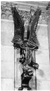
Fig. 30. Princess Louise Caroline Alberta, Boer war memorial , 1899-1905. Bronze. London, Saint Paul's Cathedral, Southern transept.