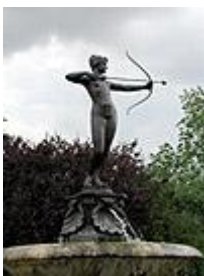
Fig. 10. Feodora Gleichen, Diana/Artemis Fountain , 1899. Bronze. London, Hyde Park, rose garden north of Rotten Row.