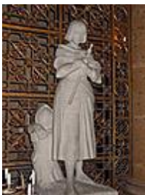
Fig. 27. Replica of Princess Marie-Christine of Orléans, Jeanne d'Arc in prayer , 1835-1837. Marble. Paris, Church of Saint-Vincent-de-Paul (10th arr.), ambulatory.