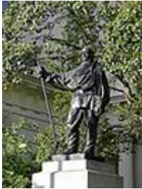
Fig. 24. Kathleen Scott, Captain Robert Falcon Scott , 1915. Bronze. London, St. James's, Waterloo Place.

space, as we have seen, this was the first one with such a size and impact. Some commentators therefore drew attention to this, and saw the princess as a pioneer; Building News called the statue “noteworthy as the first memorial executed by a woman erected in the metropolis” and the Art Journal similarly spoke of it as “the first statue, the work of a woman, that has been erected in London” and went as far as to say that “it reflects credit on the Princess as the most satisfactory of the many similar statues now in existence.” 61