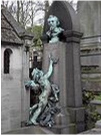
Fig. 35. Jeanne Itasse-Broquet, Tomb sculptures for Adolphe Itasse: bust and putto , 1894. Bronze. Paris, Père-Lachaise Cemetery, 33rd division.