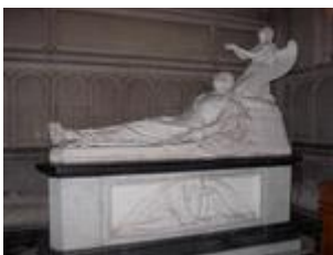
Fig. 28. Princess Marie-Christine of Orléans, Angel (part of the tomb of Ferdinand, Duke of Orléans), angel: 1837/tomb: 1842-43. Marble. Paris, Neuilly-sur-Seine, Porte Maillot, Chapelle Saint-Ferdinand (Notre-Dame de la Compassion) (17th arr.).

About one ninth of the retraced sculptures for the period 1789 to 1914, around twenty-five objects, can be linked to religious architecture, and this percentage almost doubled to one fifth in 1950. Though a male-dominated institution, the church has long known a tradition of female devotion and patronage. In the nineteenth century, especially, women fulfilled social and philanthropic activities within the context of the church. Anne Digby therefore names the church as an example of a "borderland," an area in between the public and private spheres, where women's activities in the public domain were tolerated up to a point. 71 Women's sculptures in those places could also be seen as occupying a borderland between the public and private. In the church the activities of female patrons and artists sometimes came together. The commission to the Scottish Mary Grant for an altarpiece for the cathedral of Edinburgh, for example, came from "the church-women of Scotland." 72 Grant's religious conviction probably contributed to her receiving numerous church commissions in the last quarter of the nineteenth century, when the growth of Anglo-Catholicism stimulated an increased demand for church decoration. Her Saint Paul for Saint Paul's Cathedral in London, though, was not accepted. 73