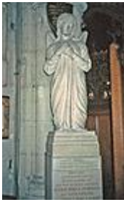
Fig. 29. Princess Louise Caroline Alberta, Angel - Memorial for her deceased brothers Alfred, Duke of Edinburgh, and Leopold, Duke of Albany , c. 1900. Marble. London, Kensington, St. Mary Abbots Church, ambulatory.