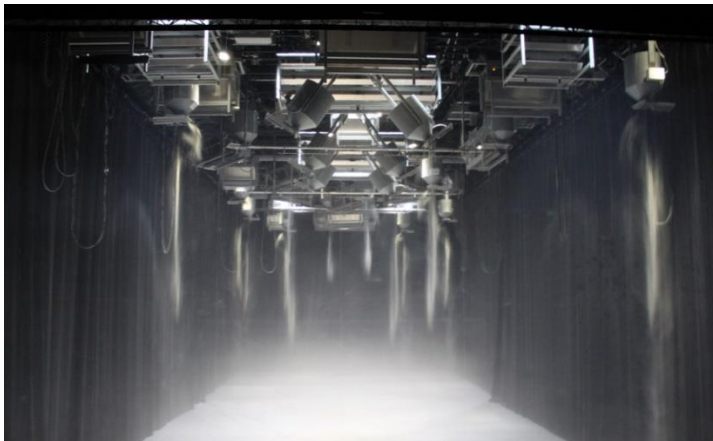
Romeo Castellucci - Le Sacre du Printemps

Another performance referring to the dance-tradition is Romeo Castellucci's Sacre du printemps (rite of spring). I would like to present this performance as