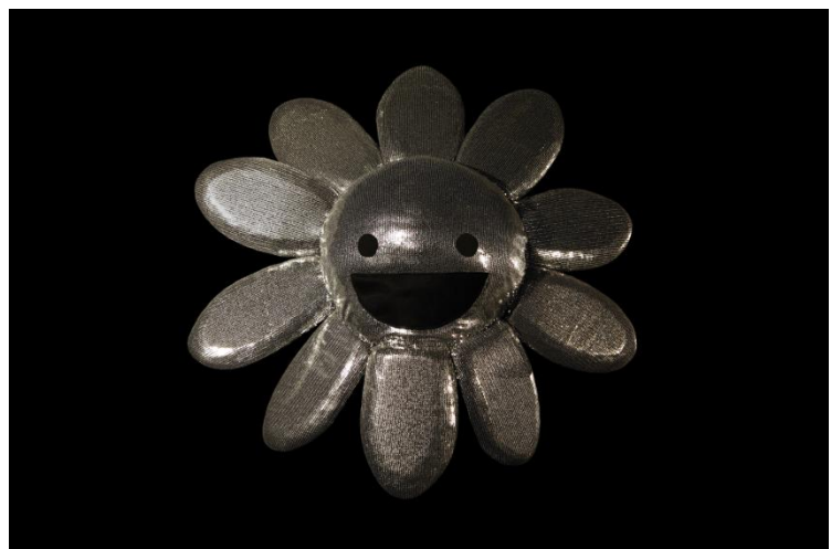
Kris Verdonck / A Two Dogs Company- Untitled

seems to tell us. The mascot in Untitled is the synthesis of the hologram's dematerialized image of the human and the material performing nonhuman machines: it is the material image, reminding of Guy Debord's assertion that The