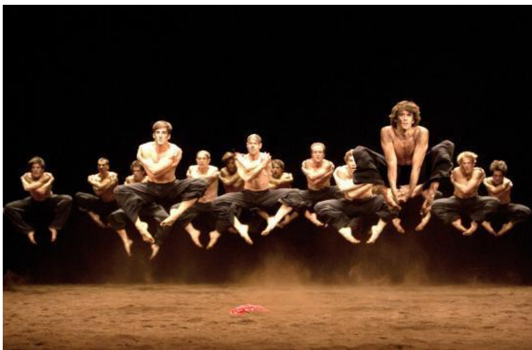
Pina Bausch - Sacre du Printemps

printemps from 1975, in which brown earth lay on stage and created upward clouds in reaction with the dancers' movements. Instead of the dust moving upwards, here it comes down, in this way