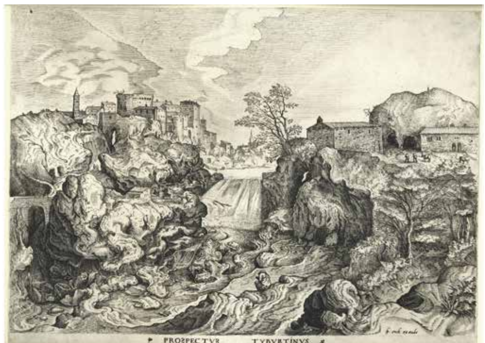
8 Joannes and Lucas van Doetecum, View of the Tiber near Tivoli ( Prospectus Tyburtinus ), c. 1555-56, etching and engraving, 32 x 42 cm.

During the Middle Ages, mountains in general and the Alps in particular, were often regarded as dangerous phenomena that inspired awe. Although this particular perception still persisted during the sixteenth century, the fearful sentiment was gradually altered through a great admiration accompanied with a profound interest in the phenomenon. 63 It was during this period that the first accounts appeared describing the impressions created in the minds of early modern travelers beholding these impressive natural manifestations. Nowadays it is difficult to grasp the major impact beholding such mountain landscapes must have had on contemporary viewers. It is well known that at some point during his journey, Bruegel crossed the Alps and beheld these undoubtedly overwhelming mountainous landscapes. It is indisputable that these made an everlasting impression on him. In his biography of the artist, Van Mander wrote: 'On his travels he