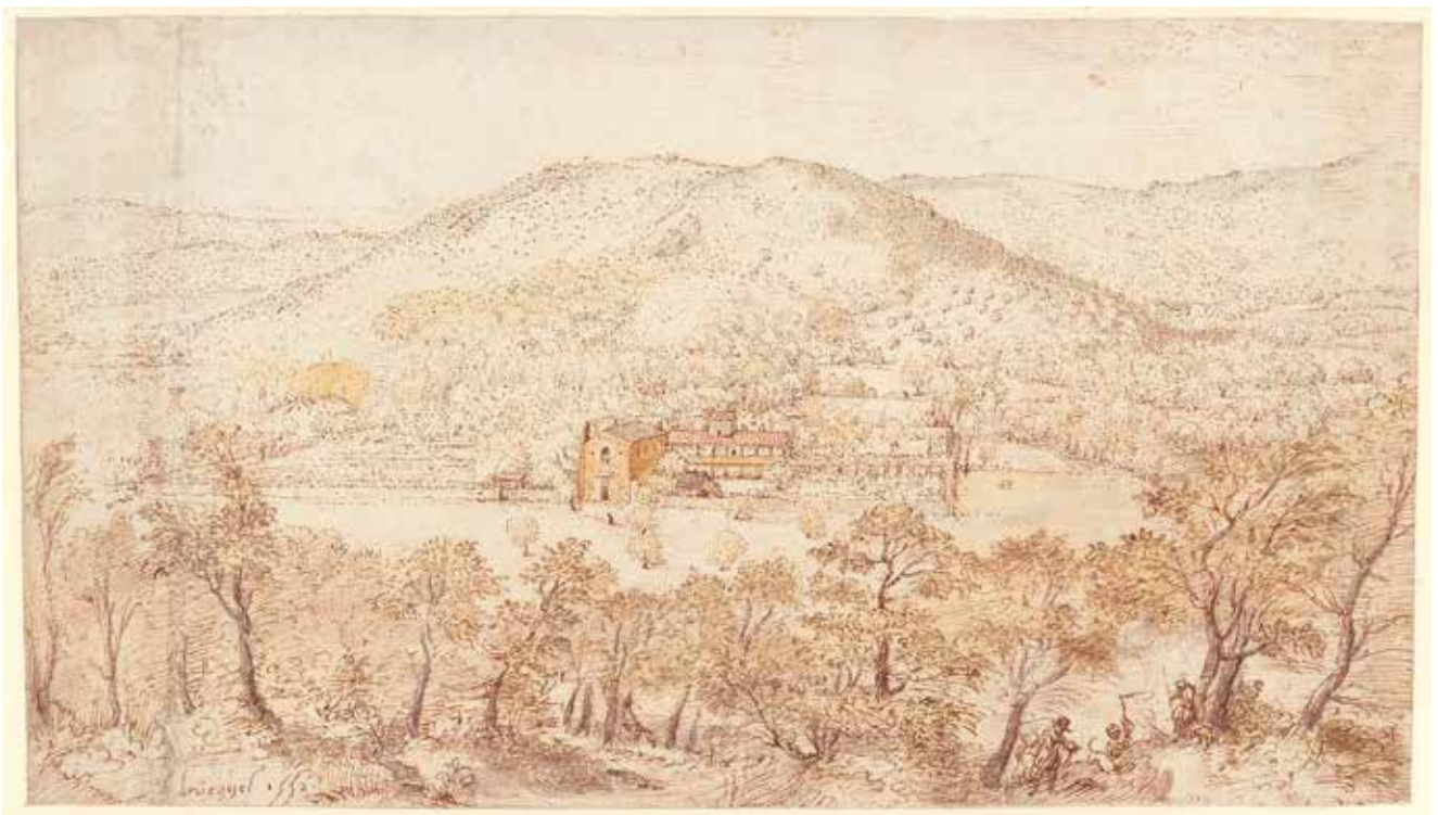
1 Pieter Bruegel the Elder, Southern Cloister in a Valley , 1552, pen and brown ink, accents in watercolour by a different hand, 18,5 x 32,6 cm. Staatliche Museen zu Berlin, Kupferstichkabinett, inv. no. KdZ 5537.

Southern Cloister in a Valley is one of the earliest known landscape drawings from Bruegel's hand (fig. 1). 24 The original drawing was executed in pen and brown ink and the sheet contains a French watermark. Bruegel signed the work in a rectangular space on the bottom left and also dated it '1552'. Despite the washes added by a later hand,