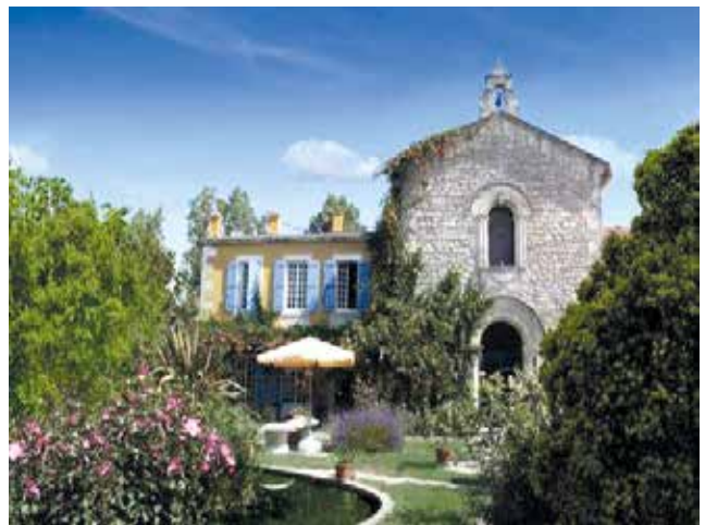
4 Abbey Notre-Dame of Sénanque, Gordes.