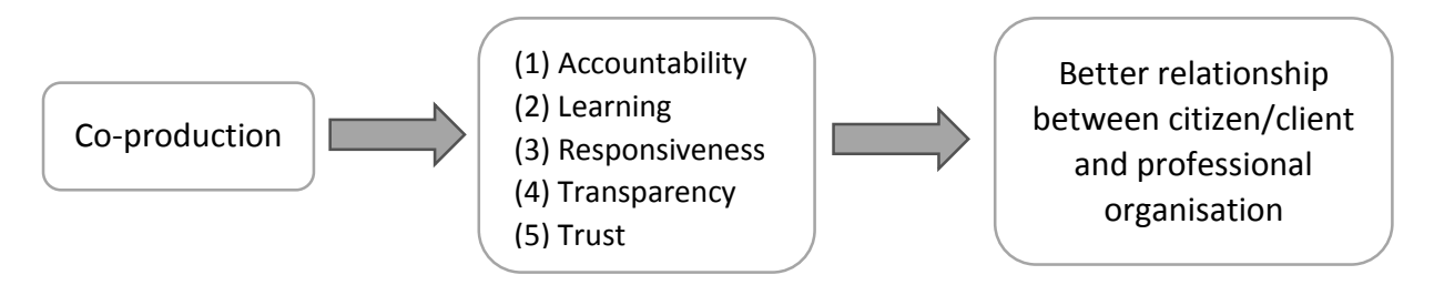
Figure 1: Cluster Better relationship between citizen/client and professional organisation

In this second cluster of assumptions, the idea is that co-production leads to a better relationship between client/citizen and professional. Within this cluster, we can discern several 'intermediate' effects that aid in the achievement of a better relationship. From the literature reviewed, we may assume that through co-production, (1) the government's actions become more accountable . We can further assume that (2) by co-producing, citizens and administrators work in close contact, which induces mutual learning , (3) which in turn may result in a more responsive government, that answers the citizens' needs. Also, (4) co-production may aid in government transparency , as it should become easier for citizens to acquire information via co-production. And lastly, (5) the citizens' trust in government, a very important aspect when considering the government-citizen relationship, could improve drastically. After all, citizens can now put a name and a face to the government.