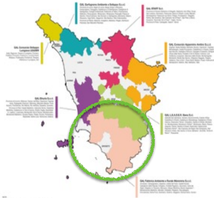
Figure 1. The LAG F.A.R. Maremma

As typical of LEADER program, every LAG has got a mixed private-public partnership: in the case of LAG FAR Maremma during the period 2007-2013 the LAG's Assembly of the members was composed of 32 public bodies and 35 private bodies for a total of 67 members. Since 2007 the LAG Board has been composed by 12 members, 9 from the private sector and 3 from the public sector. It's interesting to highlight that the public sector is represented by the Mountain Communities, that's a strategic choice given that each Community can give voice to several Municipalities of its area.