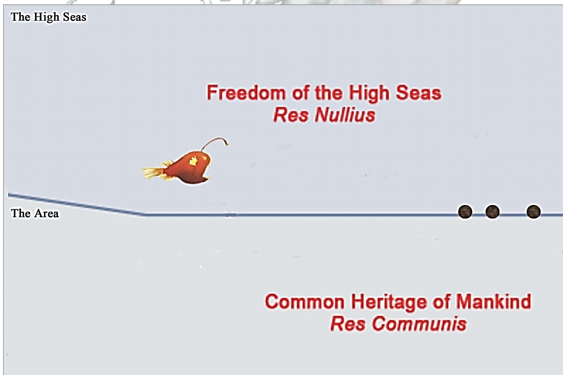
Fig.1: Division of international maritime spaces and their governing principles.

By demonstrating the role of marine organisms in the formation and composition of deep-sea mineral resources, the aim of this poster is to demonstrate that legal definitions can sometimes be relatively simplistic and limited. Considering that on the deep seafloor, the meaning of legal terms can determine the applicable legal regime, this study represents an important aspect of academic legal research. The overall goal is to introduce the interpretation methodology that will be used in the author's PhD research project on the legal framework of deep-sea mining.