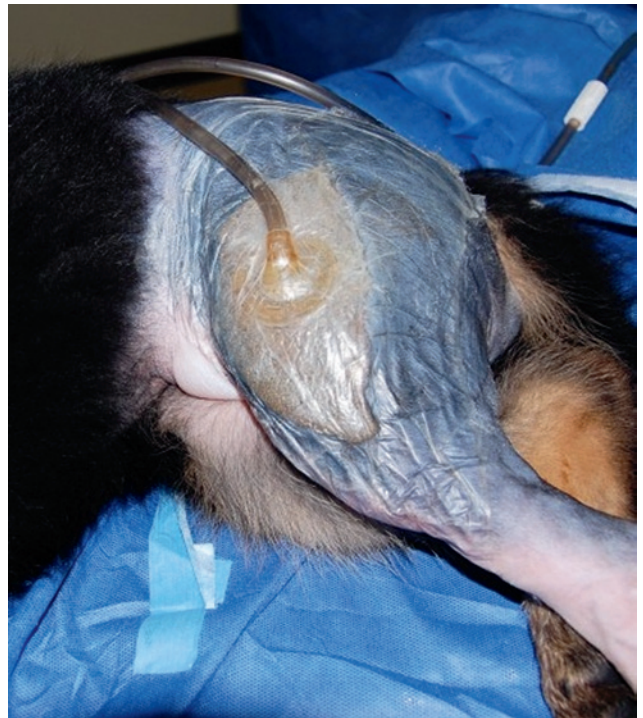
Figure 4. Photograph after application of a NPWT device. A silver-impregnated polyurethane foam dressing was placed inside the wound (including the associated cavity) and covered with a polyurethane adhesive drape. An interface pad and extension tubing were then applied onto the drape over a 2 cm-diameter opening created in the drape, and connected to the negative pressure source.

A presumptive diagnosis of NF was made. The patient was hospitalized and received isotonic crystalloid (Hartmann®, B-Braun, Brussels, Belgium) fluid therapy and colloids (Tetraspan®, B-Braun, Brussels, Belgium) at 10 mL/kg/hour and 1 mL/kg/hour respectively. Pain was managed with the administration of methadone (Comfortan®, Dechra, Heusden-Zolder, Belgium) (0.2 mg/kg IV q 4h), and amoxicilline-clavulanate (Augmentin®, GSK, London, United Kingdom) (20 mg/kg IV q 8h) as well as clindamycin (Antirobe®, Pfizer, Zaventem, Belgium) (13 mg/kg PO q 12h) were administered, while awaiting the bacterial culture results.