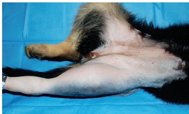
Figure 1. Photograph of the affected left hind limb of a German shepherd puppy at presentation. Painful, ill-defined and diffuse soft tissue swelling, extending from the greater trochanter to the stifle joint.

On presentation (day 0), a general physical examination revealed a recumbent, lethargic dog with a painful, ill-defined, diffuse soft-tissue swelling of the left hind limb extending from the greater trochanter to the stifle joint (Figure 1). Mild pitting edema was