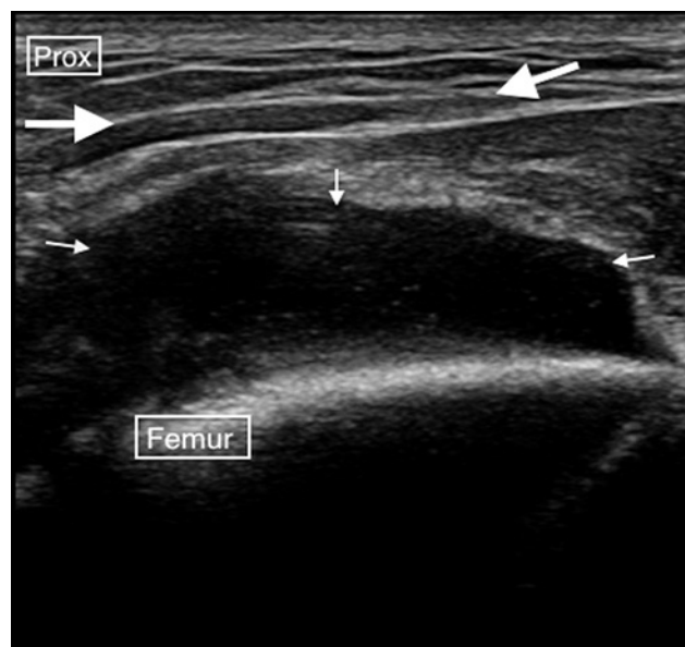
Figure 2. Transverse ultrasonographic view of the affected hind limb. Note the fluid-filled cavity containing anechoic fluid with multiple hyperechoic specks (small white arrows), and the inflammation and edema of the perimuscular tissues (big white arrows).

Orthogonal radiographs of the left hind limb showed a diffuse, poorly circumscribed soft-tissue opacification in the region of the lateral and caudolateral femoral diaphysis, extending from the greater trochanter to the stifle. An ultrasonographic (iU22 xMATRIX, Philips, Amsterdam, the Netherlands) examination was subsequently performed on the affected hind limb, using a linear array multifrequency probe (L12-3 Broadband linear array, Philips, Amsterdam, the Netherlands) operated at a frequency of 12-13 MHz. There was a 5 \times 4 \times 12 cm well-delineated cavity at the lateral and caudolateral aspect of the femur, containing anechoic fluid with multiple small ( < 1 mm) hyperechoic specks (Figure 2). The cavity extended to the physis of the greater trochanter 1 cm proximally and distally to 3 cm proximal to the distal femoral physis. The popliteal lymph node was enlarged, rounded and hypoechoic, consistent with an inflammatory lymphadenopathy. The perimuscular