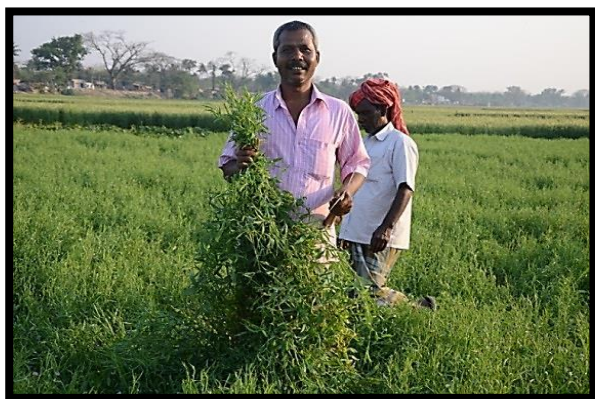
Farmer in grasspea field at Murshidabad (WB)

Despite all these merits, grasspea has an ambivalent reputation. Its seed contains a toxin, Beta-ODAP ( \beta -N-oxalyl-L- \alpha , \beta -diaminopropionic acid), which causes neuro-lathyrism a “nutritional curse” if consumed in excessive quantities for a long period of 4 to 5 months continuously. Grasspea is largely being used as adulterant with other pulses; therefore cultivation of low-ODAP or ODAP-free cultivars is highly desirable. In this endeavour, low-toxin (<0.1%) grasspea varieties with higher yield having desirable attributes like disease and pest resistance along with matching production technologies have been developed by various Indian institutions and ICARDA.