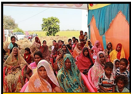
Women's training for removal of toxin from grasspea

Despite all these merits, grasspea has an ambivalent reputation. Its seed contains a toxin, Beta-ODAP ( \beta -N-oxalyl-L- \alpha , \beta -diaminopropionic acid), which causes neuro-lathyrism a “nutritional curse” if consumed in excessive quantities for a long period of 4 to 5 months continuously. Grasspea is largely being used as adulterant with other pulses; therefore cultivation of low-ODAP or ODAP-free cultivars is highly desirable. In this endeavour, low-toxin (<0.1%) grasspea varieties with higher yield having desirable attributes like disease and pest resistance along with matching production technologies have been developed by various Indian institutions and ICARDA.