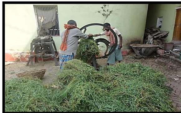
Chopping of green grasspea for fodder

about the soil testing to apply fertilizers to the crop, no knowledge of post-harvest technologies related to the crop etc. A total of 123 villages have been covered by ICARDA and its national partners with the involvement of 1959 farmers directly and 636 ha area have been replaced with the low toxin and high biomass improved varieties.