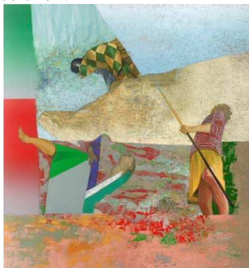
Bart De Clercq, The Rock . 2011, oil on canvas, 225cm x 238cm. Private collection.

Let us therefore take a glance at a single image (before we take a close look at it as a theoretical object , as Mieke Bal would claim) 8 from the position demanding to turn the things, always over and over again, upside-down. This could give us but one possible orientation in our search for that something we would prefer to name the meaning of vision – and, hopefully, the meaning of our own position in the world inhabited by images, the visual world we have never been independent from.