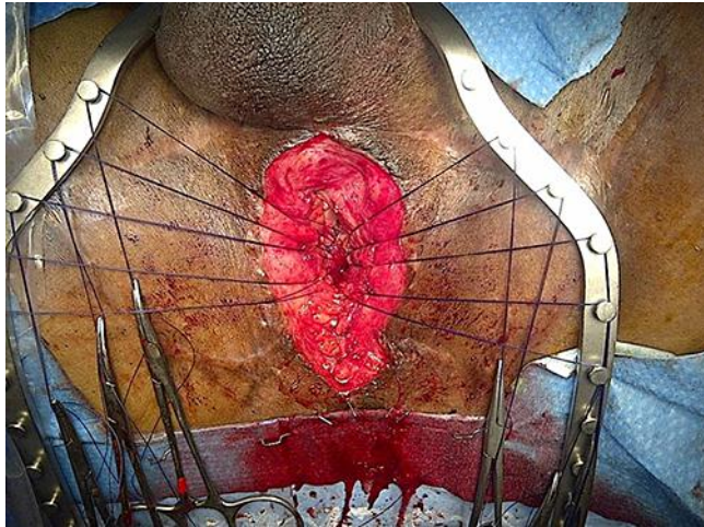
Fig. 2. The urethra has been opened and surrounding fibrotic tissue has been resected. Vicryl 4.0 sutures are placed to prepare the anastomosis for the graft.