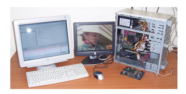
Figure 2. Photograph of our wavelet-based scalable video decoder in action.