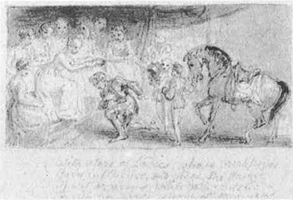
FIGURES 4a–4c Vignette designs, The Royal Engagement Pocket Atlas for the Year MDCCCXXVI (Houghton Library reference number: fMS Typ 791).