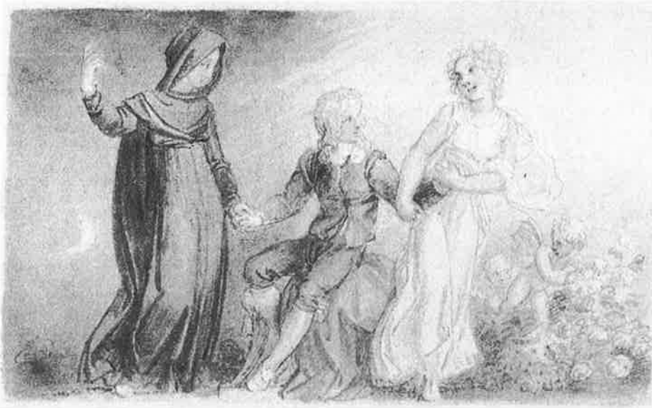
FIGURE 3 Frontispiece design for The Royal Engagement Pocket Atlas for the Year MDCCCXXVI (Houghton Library reference number: fMS Typ 791). Reproduced with permission of Houghton Library, Harvard University.

as the earlier 1788 illustrations of 'Il Penseroso' had been, Stothard's iconotextual narrative for the 1826 number of the atlas is organic and a positive rendering of man as a contented being who is social but at the same time also contemplative. None of the images of the sublime and the transcendental or a striving for the esoteric are given; instead, man is encouraged to dream — the emblematic figure of the dreamer being taken up repeatedly by Stothard throughout his work for the pocket atlas. In Stothard's vignettes 'the light fantastic toe' ('L'Allegro', l. 34) is as much part of man as human beings frequenting the 'arched walks of twilight groves' ('Il Penseroso', l. 133).