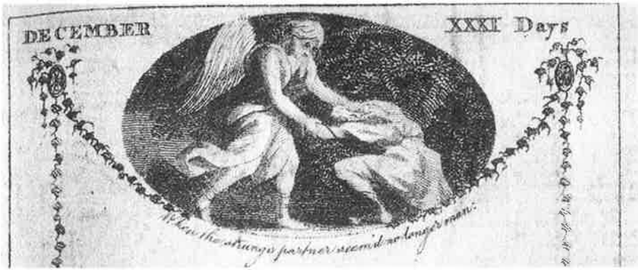
FIGURE 1 December vignette (verso), The Royal Engagement Pocket Atlas for the Year MDCCXC (Southampton: published by T. Baker, 1789). Reproduced from a copy in the author's collection.

As part of a comparative study of the Milton designs in the pocket diary numbers for 1788 and 1826, I examined the British Library copy of the pocket atlas for 1788, 35 seeking to identify in which ways a sequential order, to be found in later series of vignettes, was established in Stothard's illustrations. To do this, I checked each line against the text of 'L'Allegro' and realized that, despite the clear statement on the Contents page of the volume that the vignettes illustrated 'L'Allegro', the vignettes do in fact represent visualizations of moments from 'Il Penseroso'. 36 Surprising as this discovery is, it explains what appeared odd to me — that Baker would choose to have the same short poem illustrated twice within a couple of years of the publication of the first set in 1786. In any case, both the untraced number of the pocket atlas for 1786 and the designs for 1788 provide