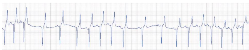
Sinus arrhythmia during recovery from exercise results in 'accordion-like' changes in heart rate.

High vagal tone may prevent the sinus nodal impulse to exit from the sinus node into the atrial myocardium. As such, one P wave and QRS-T