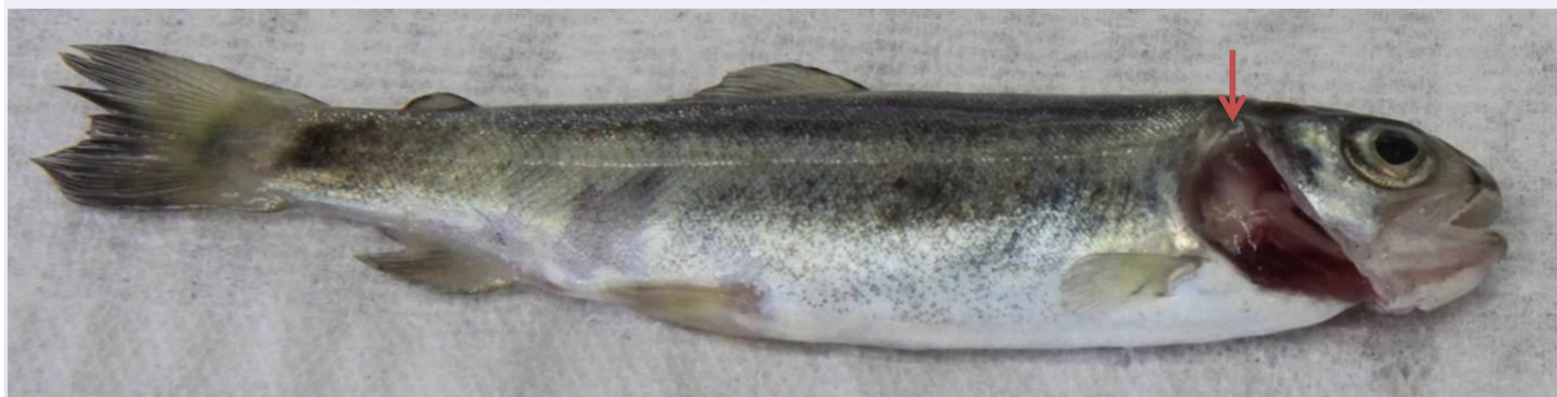
Fig. 1. Rainbow trout : gill necrosis caused by F. columnare (arrow, operculum removed)

Flavobacterium columnare is the causative agent of columnaris disease, a predominant bacterial disease of both cultured and wild fresh-water fish. F. columnare infections may result in skin lesions, fin erosion and gill necrosis (Figures 1 and 2), with a high degree of mortality, resulting in severe economic losses. Hitherto, only limited data are available on the antimicrobial sensitivity pattern of F. columnare . This information