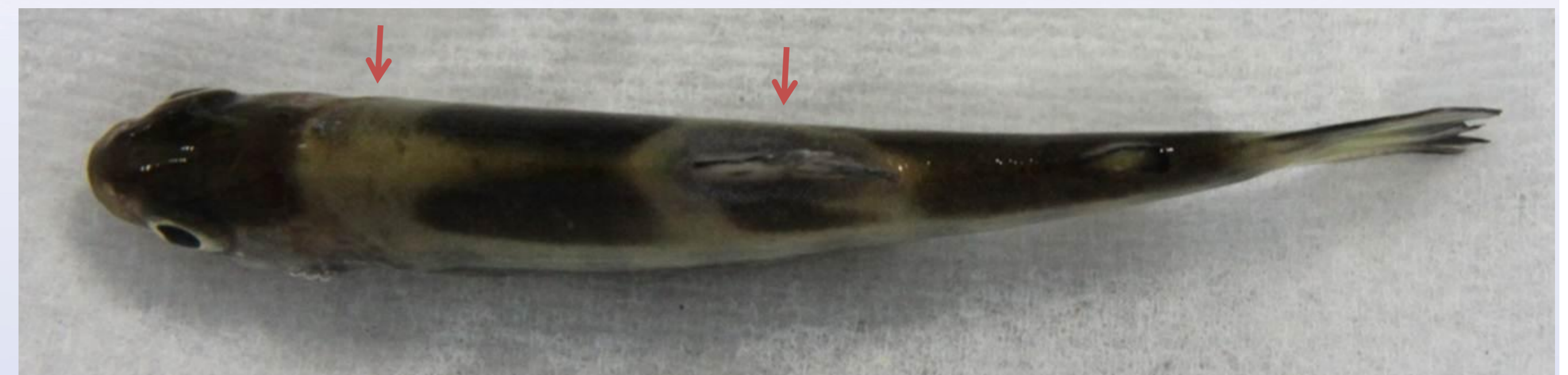
Fig. 2. Rainbow trout : typical skin lesions caused by F. columnare (arrows)

Flavobacterium columnare is the causative agent of columnaris disease, a predominant bacterial disease of both cultured and wild fresh-water fish. F. columnare infections may result in skin lesions, fin erosion and gill necrosis (Figures 1 and 2), with a high degree of mortality, resulting in severe economic losses. Hitherto, only limited data are available on the antimicrobial sensitivity pattern of F. columnare . This information