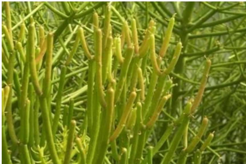
Plate 1. Red pencils of E. tirucalli specimens from US (New York State).

Order: Malpighiales. Family: Euphorbiaceae. Genus: Euphorbia . Species: E. tirucalli . Binomial name: Euphorbia tirucalli L.