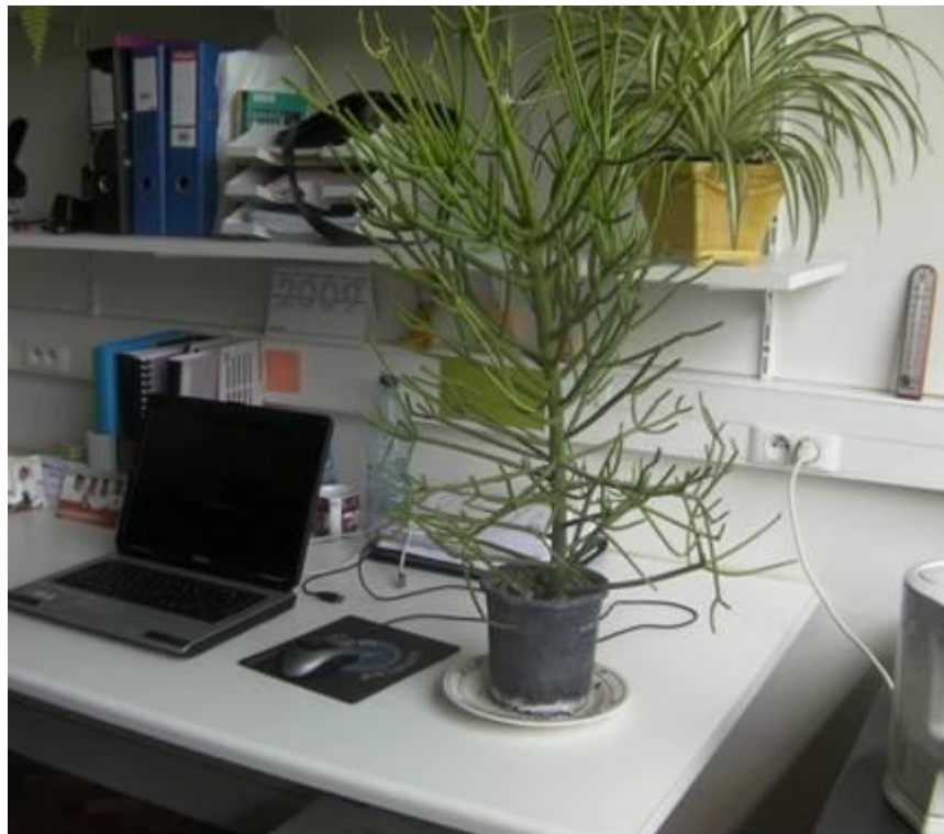
Plate 4. E. tirucalli potted plant as an ornamental.

and swellings. Root scrapings mixed with coconut oil are taken for stomach-ache. In India, Kumar (1999) notes that it is an unavoidable plant in most traditional homesteads and used as a remedy for ailments such as: spleen enlargement, asthma, dropsy, leprosy, biliousness, leucorrhoea, dyspepsia, jaundice, colic, tumors and bladder stones. He further says that although the latex of vesicant and rubifacient is emetic in large doses, it is purgative in small doses and applied against toothaches, earaches, rheumatism, warts, cough, neuralgia and scorpion bites. The same author points out that its branch and root decoctions are administered for colic and gastralgia while ashes are applied as caustic to open abscesses. Duke (1983) and Van Damme (1989) mention that, in Brazil, E. tirucalli is used against cancer, cancrivores, epitheliomas, sarcomas, tumors and warts, although they argue that this has no scientific basis since the same tree is known to be co-carcinogenic. In Malabar (India) and the Moluccas, latex is used as an emetic and anti-syphilitic while in Indonesia, the root infusion is used for aching bones while a poultice of roots or leaves is used to treat nose ulcers, hemorrhoids and extraction of thorns. Wood decoctions are applied against leprosy and hands and feet paralysis following childbirth (Duke, 1983). The same author states that in Java, the plant latex is used to cure skin ailments and bone fractures.