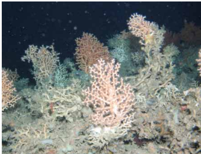
Above: Dead Lophelia pertusa with living Madrepora oculata on top (Guilvinec Canyon)

1 RENARD CENTRE OF MARINE GEOLOGY, DEPT. GEOLOGY & SOIL SCIENCE, GHENT UNIVERSITY, KRIJGSLAAN 281 S8, B-9000 GENT, BELGIUM 2 MARINE BIOLOGY SECTION, DEPT. BIOLOGY, GHENT UNIVERSITY, KRIJGSLAAN 281 S8, B-9000 GENT, BELGIUM