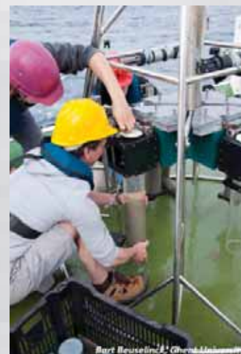
Above: Happy UGent biologists retrieving another successful multicore sample!

Within the Guilvinec Canyon, two ROV dives were performed: one at a small spur on the northwestern flank and one at a ridge southwest of the Penmarc'h Spur. During the first dive (750-950 m water depth), thick cold-water coral rubble graveyards with living corals that had settled on top were encountered. Madrepora oculata and Lophelia pertusa were the most common species here, and were often colonized by sponges, crinoids, antipatharians and soft corals. Also, hard substrate colonized by cold-water corals and antipatharians was observed as well as soft sediment with small boulders characterized by patchy distributions of coral rubble. During the second dive, only soft sediment was observed on the southern slope of the ridge with almost no fauna. On the top of the ridge in a water depth of 680 many trawl marks had scarred the seabed. Going down the southeastern flank of the ridge, dead coral rubble patches alternated with areas covered in boulders. At some locations in this area living cold-water corals ( Lophelia pertusa and Madrepora oculata ) were seen, living on top of the coral rubble.