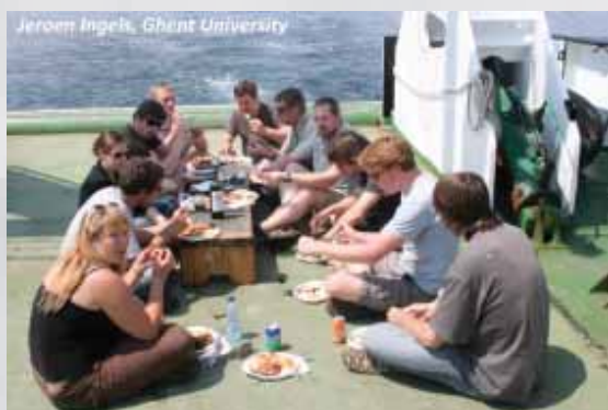
Above: Mission accomplished: time for a BBQ picnic on the afterdeck

Within the Whittard Canyon, a total of 5 successful ROV transects were performed at water depths between 450 and 1040 m. During these dives, (rippled) soft sediment, often colonized by numerous pennatulids, was seen alternately with hard substrates in the shape of small banks, ridges and/or large cliffs with heights varying between 10 cm and 8 m (even one cliff of about 50 m high). The area was characterised by an irregular topographic relief with steep slopes and frequent evidence of downslope transport. Mostly dead cold-water coral rubble was observed with occasional living cold-water corals ( Lophelia pertusa and Madrepora oculata ) on top of the rubble. Several Dendrophyllia sp. and Desmophyllum species were noticed, as well as debris from the deep-water oyster Neopycnodonte zibowii .