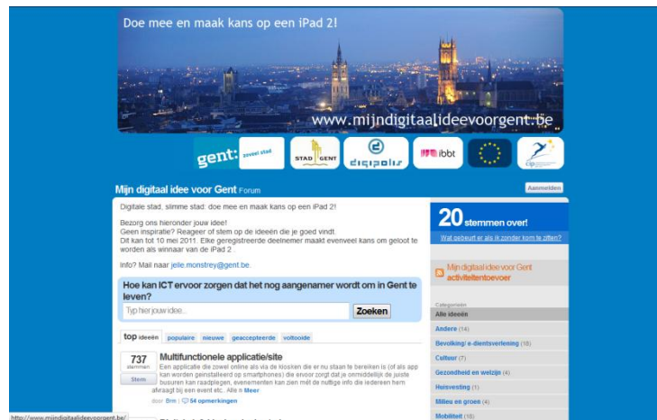
Figure 1: screenshot of the crowdsourcing platform 'Mijndigitaalideevoorgent'

The crowdsourcing platform 'Mijndigitaalideevoorgent' was open to answers on the question 'How can ICT make it even more pleasant to live in Ghent?' between April 1st and May 15th. In this period the website was visited by 5,451 unique visitors and counted 17,873 page views. The city blog 'GentBlogt.be', Facebook, Twitter and the city of Ghent's website were amongst the top referrers to the site. More than 1400 people registered their e-mail on 'Mijndigitaalideevoorgent', enabling them to submit an idea or cast votes (a total of 20) on already submitted ideas.