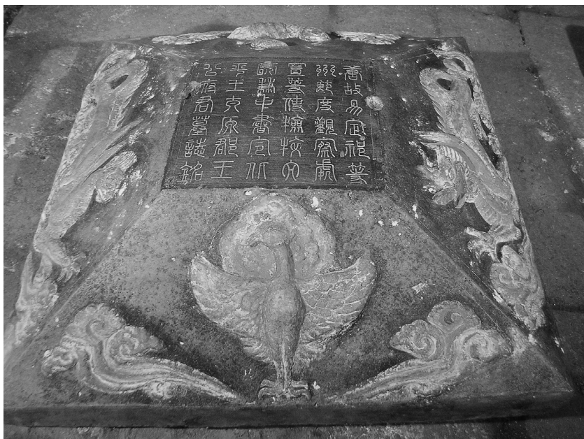
Figure 2: Cover of Wang Chuzhi's tomb inscription.