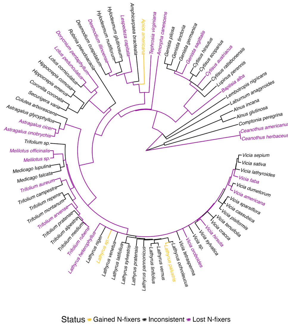
Fig. 3. Phylogenetic tree of N-fixer species in the study plots. Species could either appear in both surveys (“conserved,” none), exclusively in the baseline (“lost,” purple), and exclusively in the last resurvey (“gained,” yellow) or display different trends across sites (“inconsistent,” black).