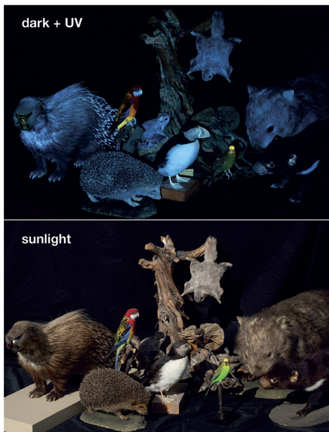
Fig. 1. Fluorescence under different lighting conditions. Exposure of museum preserved specimens to unrealistic (only UV), and natural (sunlight) lighting conditions highlights the substantial effect of fluorescence in unnatural environments. Photos by M.J.B. under standardized camera conditions (only differing in exposure time). We thank Maria Mostadius for providing access to the zoological collection of the Department of Biology of Lund University.