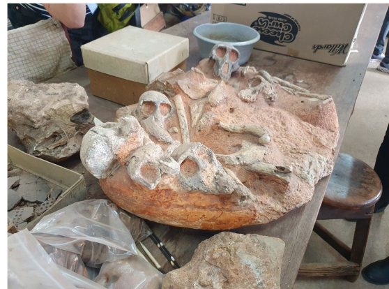
Fig. 3 Delegates visiting “The Shed” on site where they could directly interact with technicians who were delicately extracting recently discovered fossils