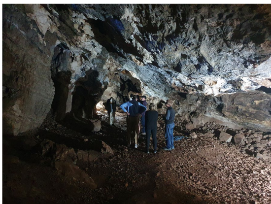
Fig. 2 Meeting participants navigated the Sterkfontein limestone caves in Gauteng Province, where some of the earliest human ancestors, hominin fossil remains were discovered