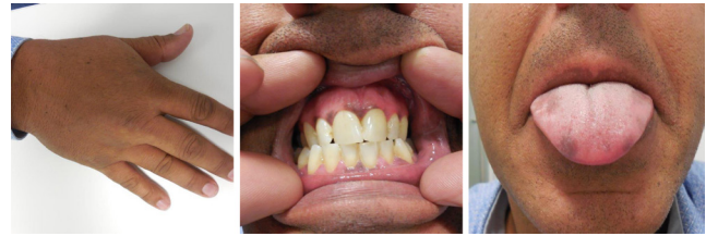
Figure 1 Hyperpigmentation of skin and mucosae.

An etiological workup was performed, including an assessment for anti-adrenal antibodies and catecholamine secretion, which was negative. 17-OH progesterone levels and very long-chain fatty acids were normal. A computed tomography of the adrenals was performed, showing bilateral enlargement of the adrenals and bilateral presence of an adrenal nodule (right: nodule with maximum diameter 44 mm, Hounsfield units (HU) 40; left: maximum diameter 14 mm, HU: 37). (Fig. 2, panel A). Further examination with a whole-body fluorine-18 fluorodeoxyglucose positron emission tomography-CT (FDG PET-CT) showed an increased FDG uptake in both adrenals (more pronounced on the right side), as well as an increased uptake in some axillary lymph nodes. A tuberculin skin test showed to be positive and may reflect either co-existence of TB carriage or TB of the